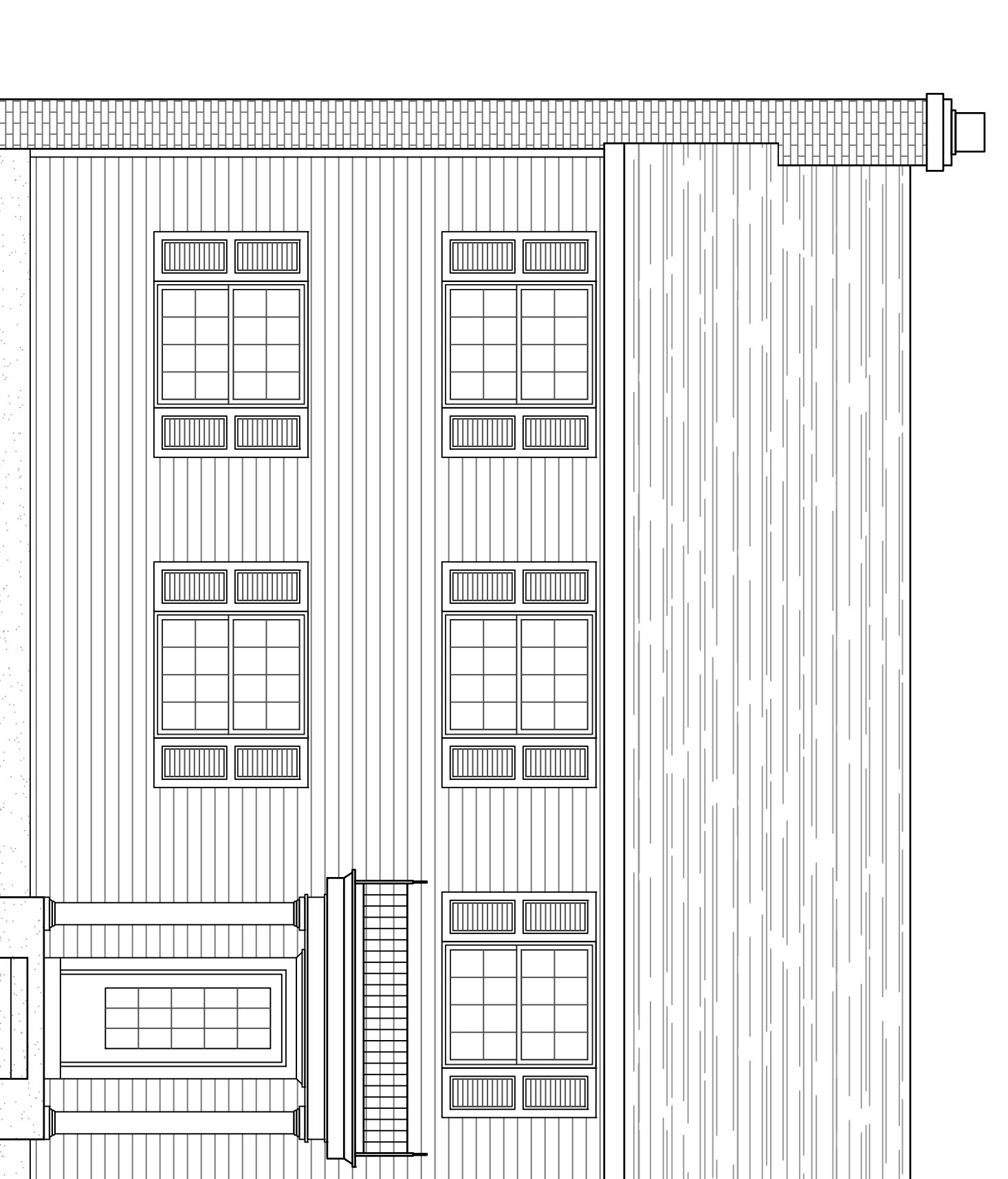
SOUTH ELEVATION #209 WEST LOCKWOOD AVENUE SCALE: 1/4"=1'-0"

BUILDING ELEVATIONS LOCKWOOD AVENUE 1/4" SCALE ON SIZE ARCH-E PAPER (36"x48")